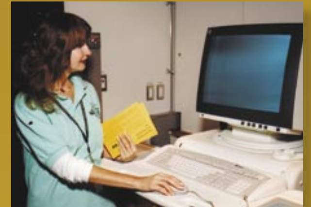
Each year Safeway dedicates the months of June and October toward raising money to fund cancer research, purchase equipment and help find a cure for prostate and breast cancer.

The prevalence of these diseases makes them everyone's concern. We understand that by supporting these efforts, we're supporting many of our own employees and their families, and thousands of our customers. With them, we will continue to work toward the day when medical research can find a cure.